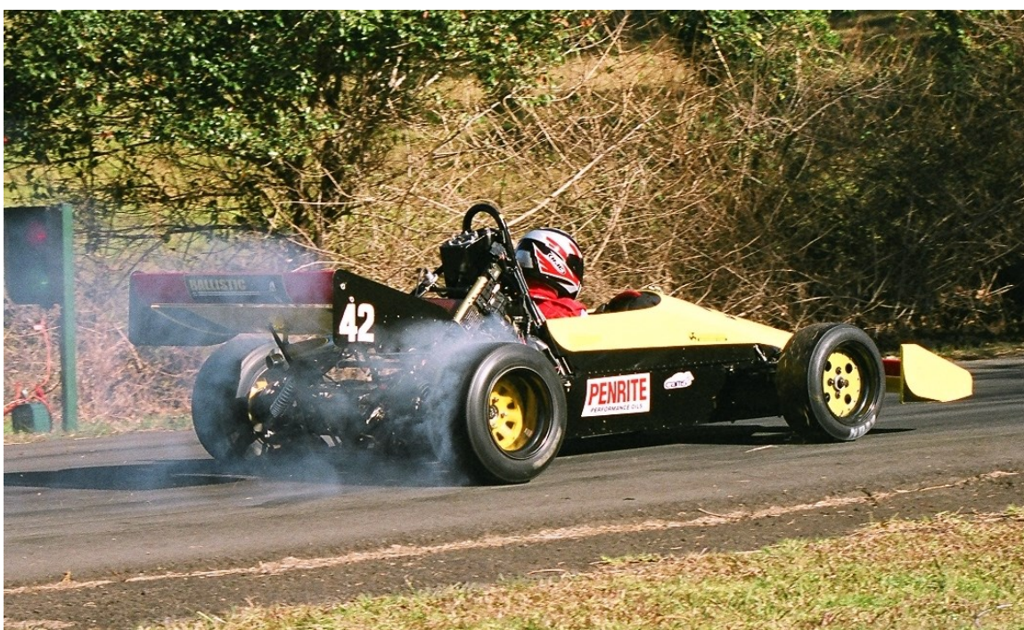
Geoff Lord spins them up as re rockets away at Huntley