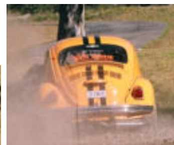
Heath Campbell tried hard all day